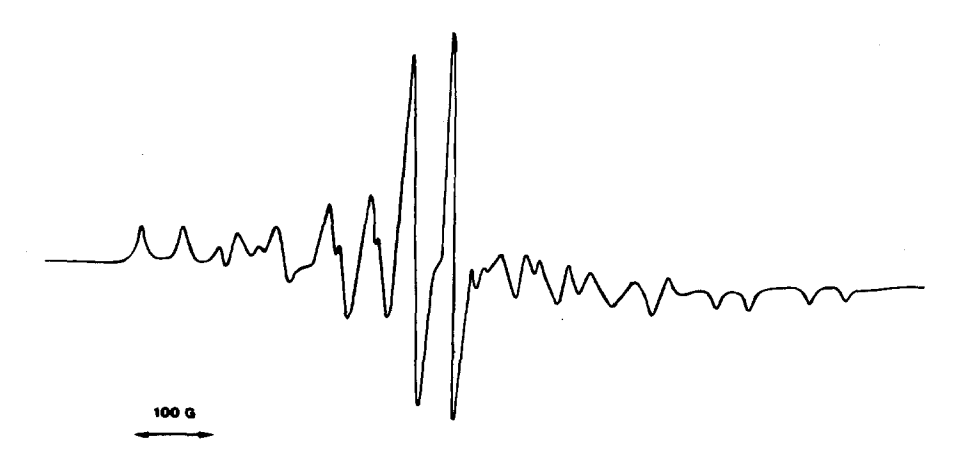
Fig. 2. EPR spectrum of [Cp<sub>2</sub>V(S<sub>2</sub>PEt<sub>2</sub>)][S<sub>2</sub>PEt<sub>2</sub>] in CH<sub>2</sub>Cl<sub>2</sub>/toluene glass at -160°C.